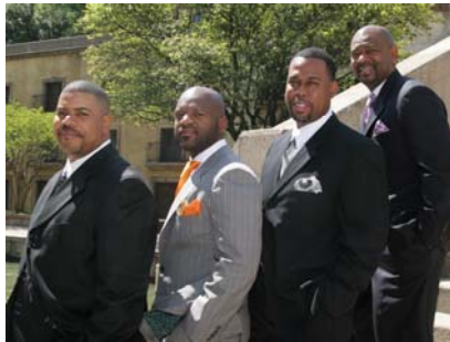
Performing Artists Natural Change